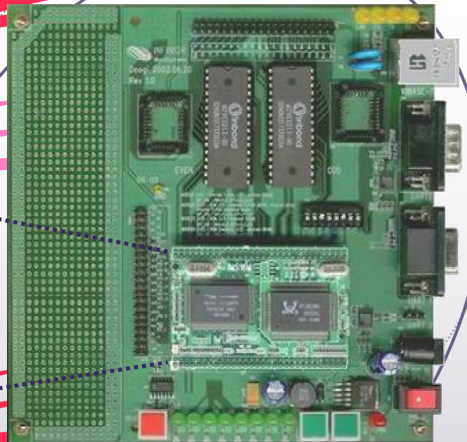
IMS16CM Evaluation Board